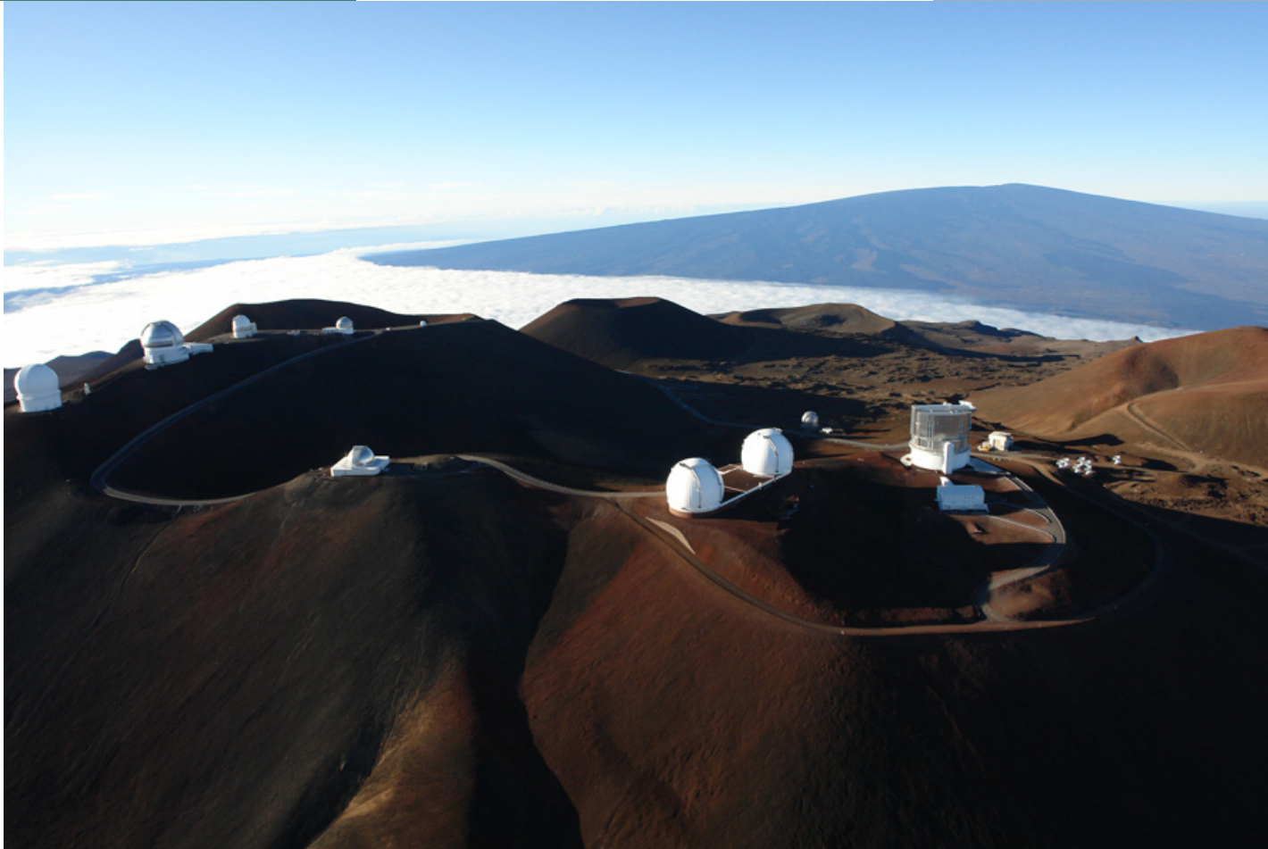
Mauna a Wakea, Isola di Hawai'i (Big Island) 2015